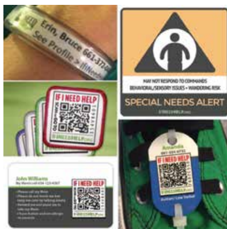
Products available at ifneedhelp.org .

We created a variety of products—everything from patches to pins, clips to shoe tags—each with a special QR code. When the person is found, the code can be scanned by a smartphone or tablet, or their number can be entered on our website to access pertinent information in an emergency. These products can, quite literally, save lives.